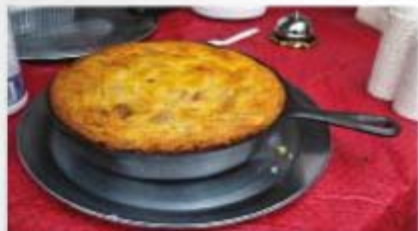
2011 Arkansas Cornbread Festival in Little Rock Terry's Cracklin' Cornbread won in the Amateur Traditional and Best Overall categories. Terry won a blue ribbon, an apron, and $500.